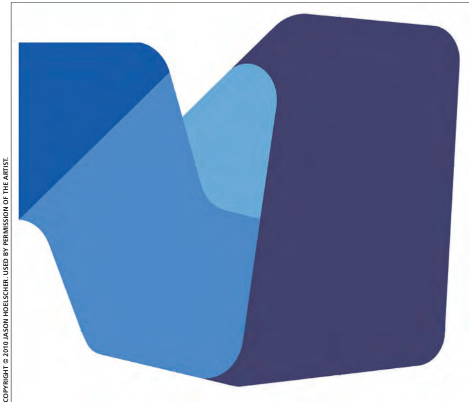
Tautologicon , 2010, by Jason Hoelscher. Acrylic latex on canvas, 44" x 66". Private collection.

In doing this on Tautologicon , an admirable placement of shapes can be recognized. First, the only place where all three of the four inner shapes converge ( X_1 ) is a point just off the center point ( A_1 ). Barely off-centering the primary focal point maintains it as locus of an orbit while giving it a touch of dynamism. The two largest shapes that orbit the smallest shape each contain three of the secondary armature intersections — b, c, d, e, f, and g — which form an ellipse around ( X_1 ). This creates a pleasing unity called enclosure, but it also makes a spin thrusting into the triangular